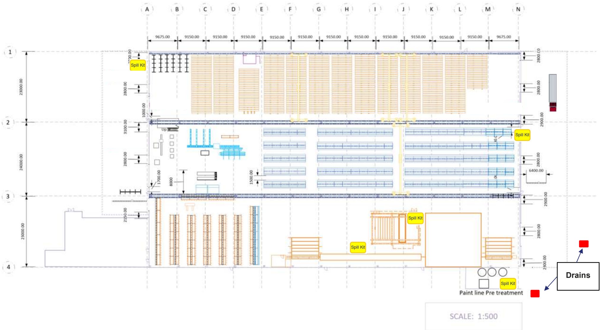
Pollution Incident Response Management Plan – Alspec Version 2025