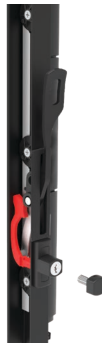
GALLERY CLOSED UNLOCKED POSITION SNIB KEY OUT