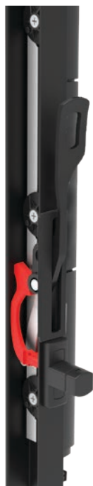
GALLERY CLOSED LOCKED POSITION SNIB KEY IN