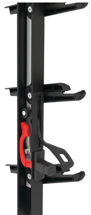
GALLERY OPEN UNLOCKED POSITION SNIB KEY IN