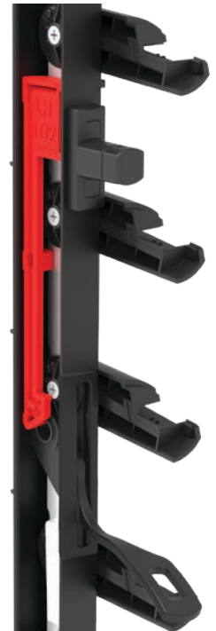
GALLERY OPEN UNLOCKED POSITION SNIB KEY IN