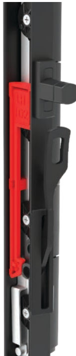
GALLERY CLOSED LOCKED POSITION SNIB KEY IN