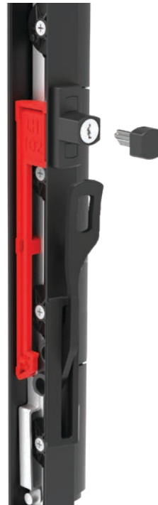
GALLERY CLOSED UNLOCKED POSITION SNIB KEY OUT