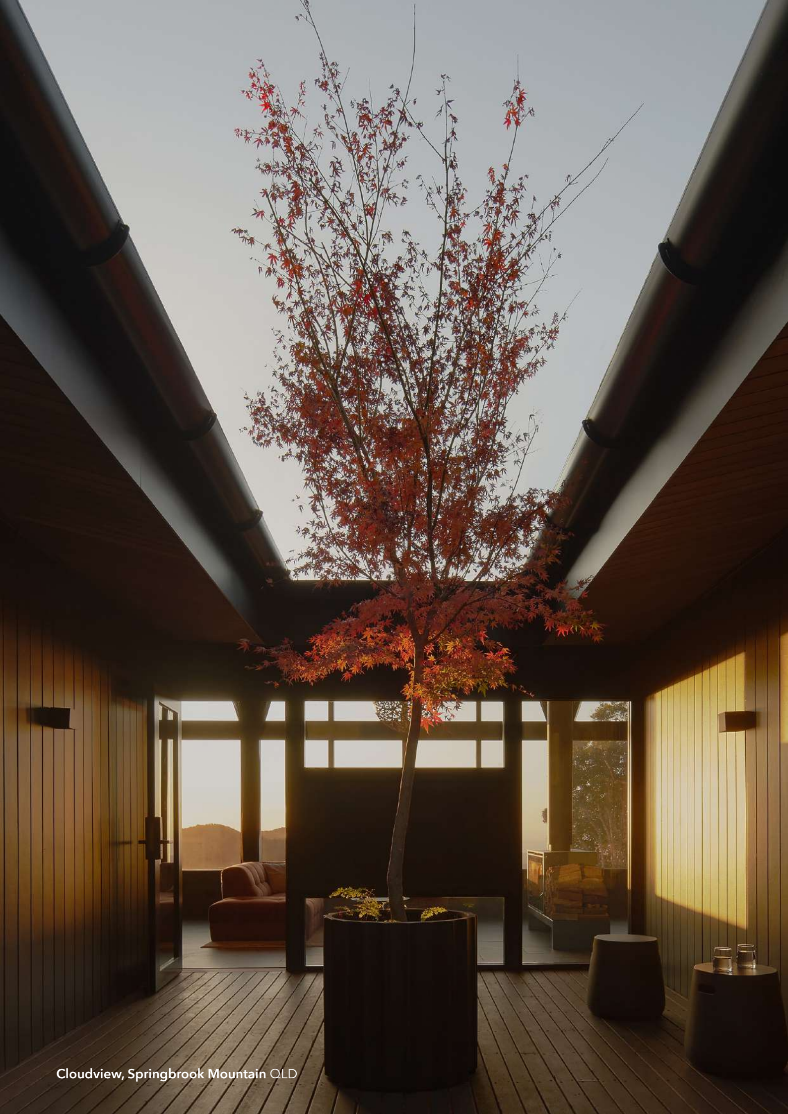
Cloudview, Springbrook Mountain QLD